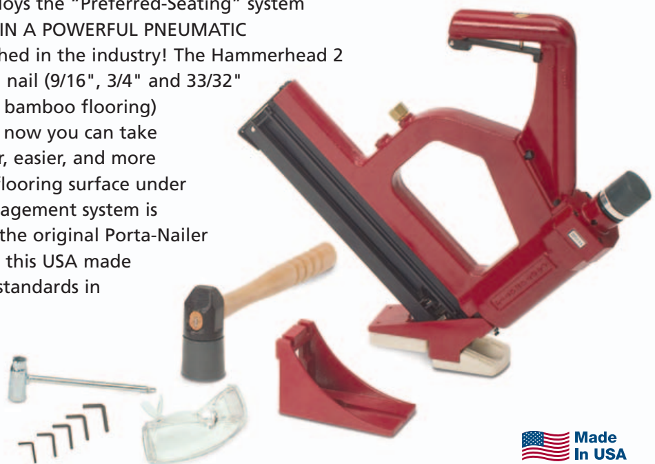
Model 421 Kit (carry case not shown)

Again, Porta-Nails is your one source for the ingenious Portamatic Hammerhead 2! Naturally, it employs the "Preferred-Seating" system as the famous Porta-Nailer – BUT IN A POWERFUL PNEUMATIC VERSION! It's versatility is unmatched in the industry! The Hammerhead 2 both angle and face nails and can nail (9/16", 3/4" and 33/32" thick flooring as well as 15-17mm bamboo flooring) with available accessory shoes. So now you can take on the biggest flooring jobs faster, easier, and more accurately for the tightest wood flooring surface under your feet. Porta-Nails quality management system is ISO 9001-2000 Registered, so like the original Porta-Nailer Hammerhead, you can be assured this USA made product is backed by the highest standards in the industry.